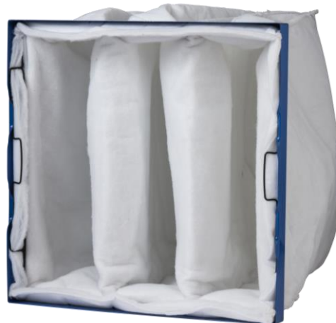
Multiwedge Deep Bed Bag Filter with Header Frame